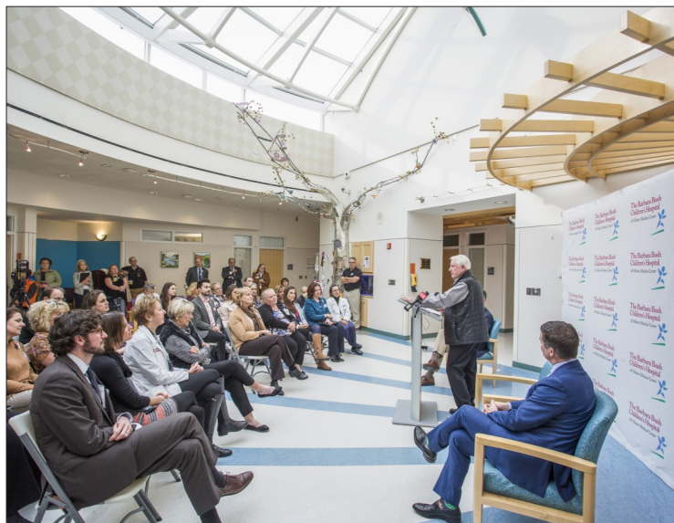
Deane Beman addresses the crowd at BBCH during the Live + Work in Maine Open press conference.