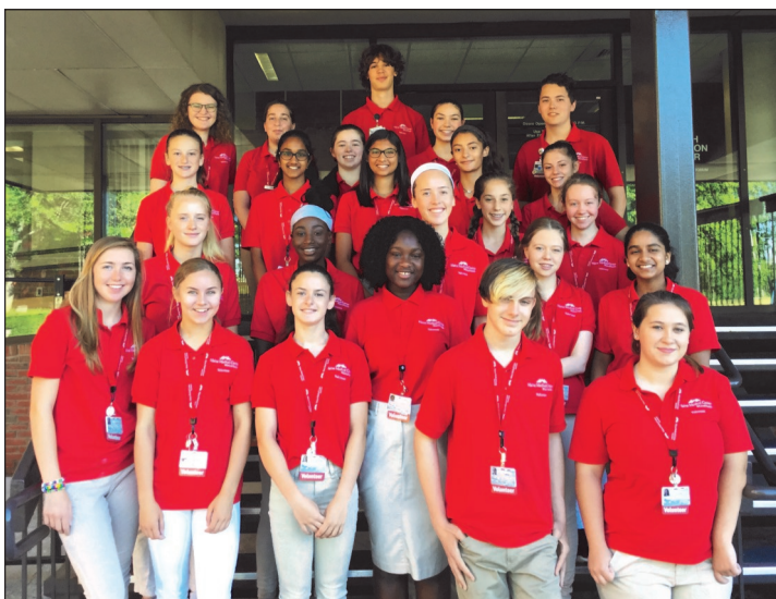
2018's Junior Volunteers gather outside MMC's Dana Center.

Do you have a teen who is interested in volunteering this upcoming summer? Maine Medical Center is looking for candidates for our Summer Junior Volunteer Program.