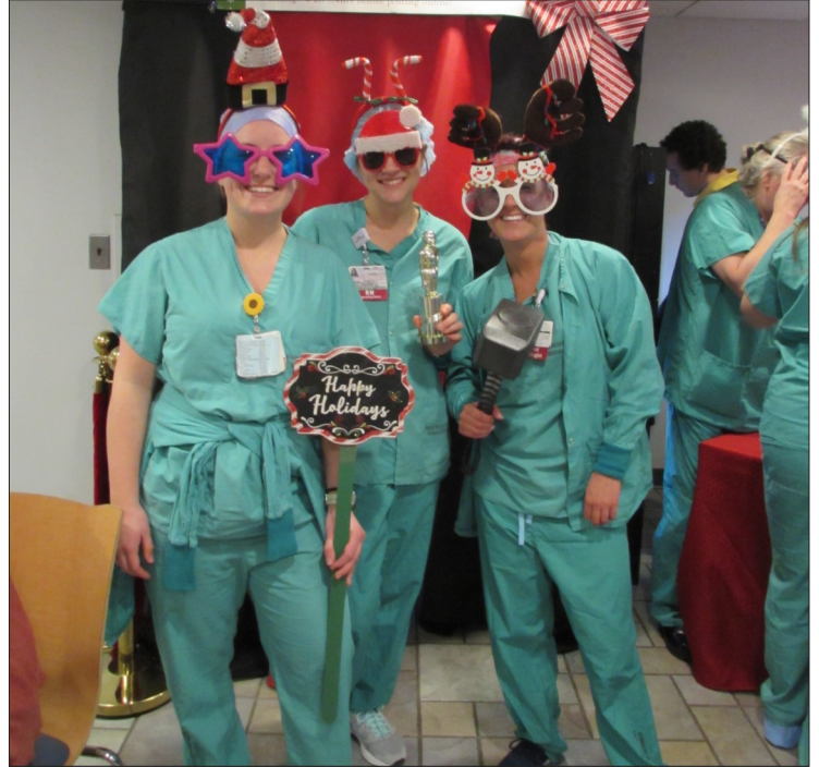
Colleagues enjoy sweet treats, a photo booth and more at the Bramhall Campus Holiday Dessert Reception.