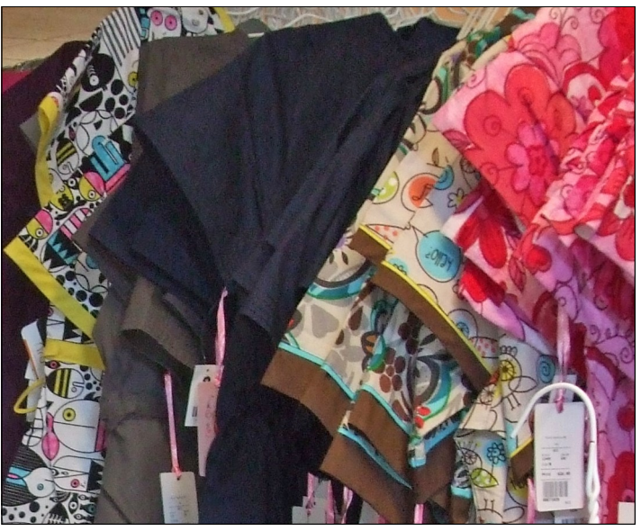
First Uniform offers many colors, patterns and styles of scrubs.

First Uniform is back at MMC this week — Tues-