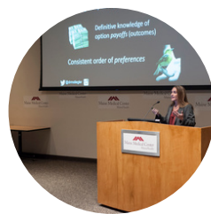
Department Grand Rounds