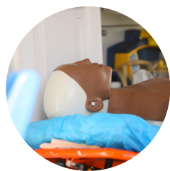
John R. Darby Simulation Grand Rounds