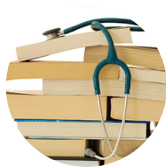
MITE Journal Club