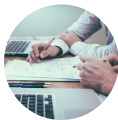
Group Manuscript Peer Review