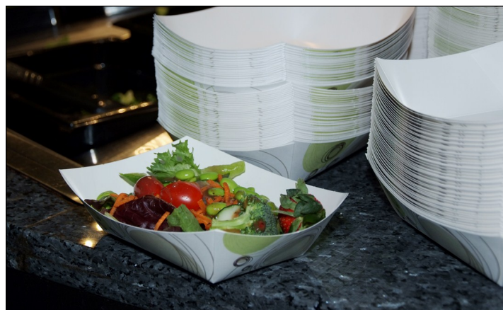
A variety of paper boat sizes are now available at the salad bar. The boats are compostable, unlike the old clamshell packaging.

Composting is another environmentally conscious change for Nutrition Services. Started as a pilot program a few months ago, the kitchen crew has been separating food waste and other