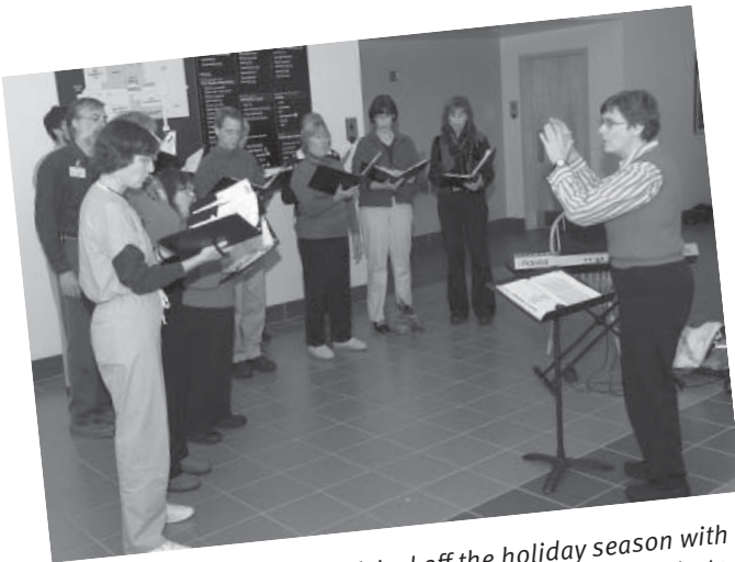
The Healing Arts Chorus kicked off the holiday season with an early December performance at MMC's Cancer Institute at the Scarborough Campus.