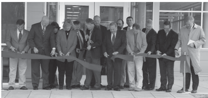
A ribbon cutting officially opens an expansion at the Maine Medical Center Research Institute.

Maine Medical Center Research Institute (MMCRI) unveiled its newest addition on December 4, a $12 million dollar expansion that houses the hospital's first dedicated clinical research facility.