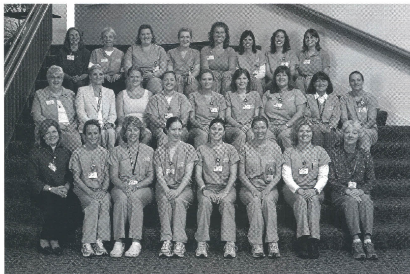
MMC's Rehab Team gears up for National Rehabilitation Week.