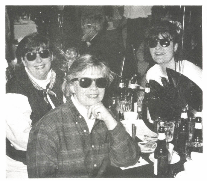
WHY ARE these women wearing sunglasses? See pages 4 and 5 to find out!

Other components required for approval of a cancer program are a multidisciplinary steering committee, frequent cancer confer-