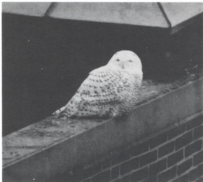
A SNOWY OWL surveys his temporary surroundings from high atop MMC.

On November 4, Maine Medical Center was a resting place for an impressive Snowy Owl. Throughout the morning, employees, patients, and visitors craned their necks to see the owl perched atop the Pavilion Building.