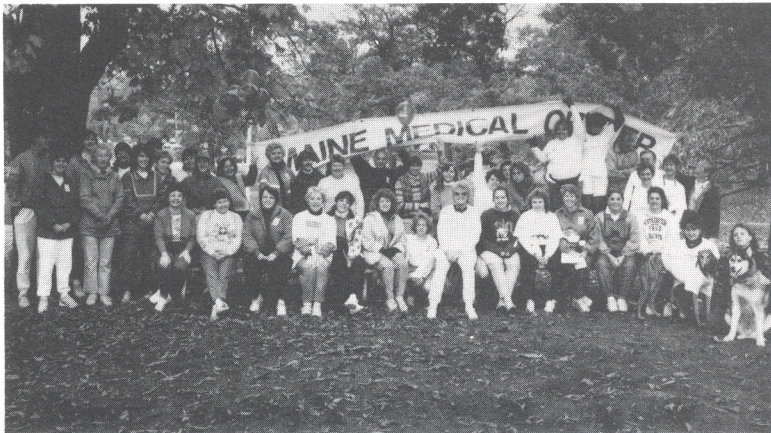
MMC EMPLOYEES, above, teamed up to walk for the American Heart Association, Greater Portland Division, helping to raise $12,000. The 10 K walk was held October 24.