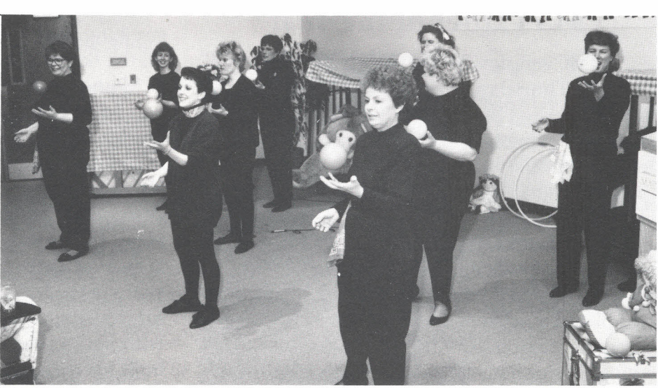
THESE BELLES were (almost) synchronized during the "ball ballet." They selected "Sweet Georgia Brown" for their music.