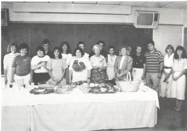
SUMMER YOUTH Employment Program participants were treated to a luncheon in recognition of their accomplishments. They were hosted by Dept. of Rehabilitation staff.