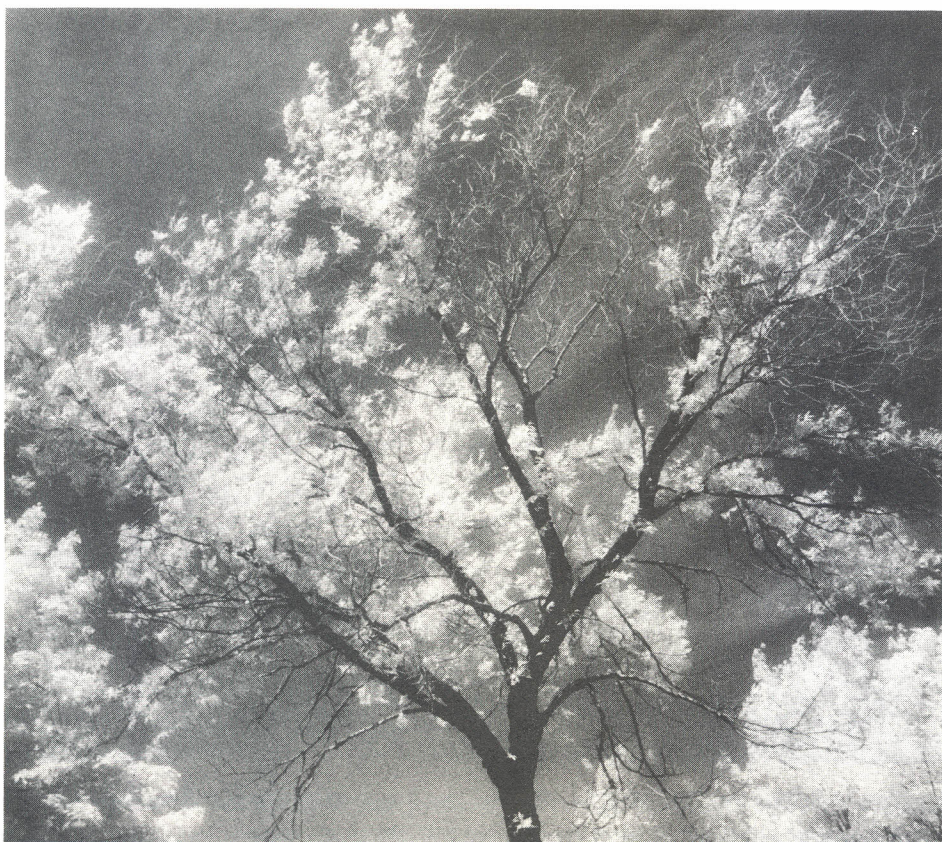
TREES on a crisp cool Autumn day. (A/V photo taken with infrared film.)

Thanks to you... it works... for ALL OF US