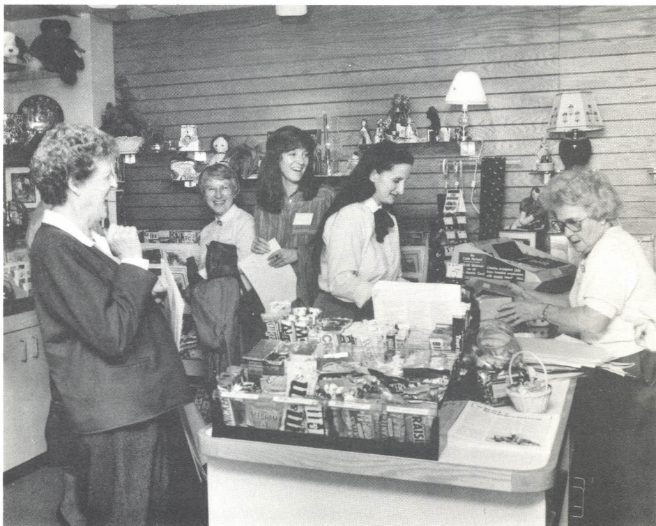
GUESTS from the Volunteer Open House take a tour through the volunteer areas of the hospital, making a stop in the Flower Box.

Women wanted for blood donations. Must be over 55 years old. Not on hormone medication. $10 paid for one tube of blood. Call Ellen at x2163.