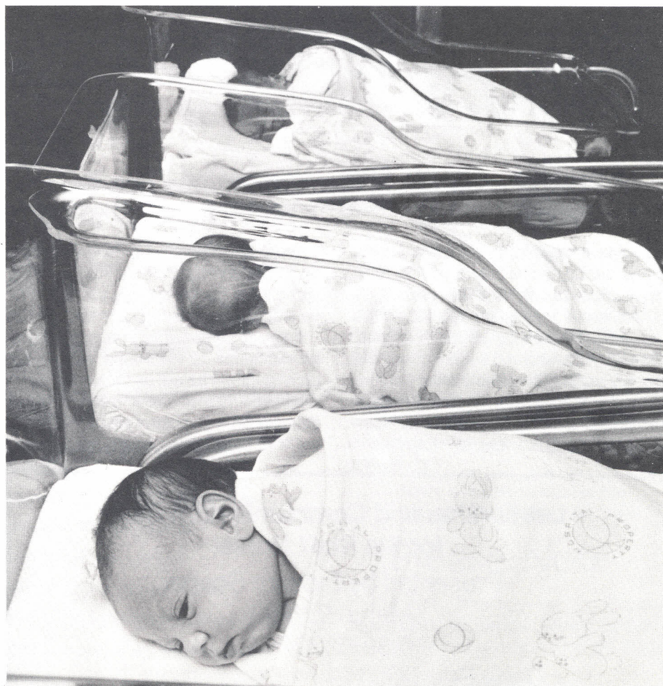
THREE babies who won't celebrate their first birthday until 1992! The babies were born at MMC last Monday, February 29th on Leap Day, which only comes around once every four years.