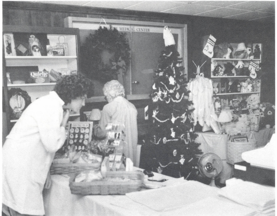
IT'S CHRISTMAS AT MMC! That's the feeling you get walking through the admitting lobby where the Gift Shop Christmas Fair is being held now through December 5. Hurry, only 30 days until Christmas.