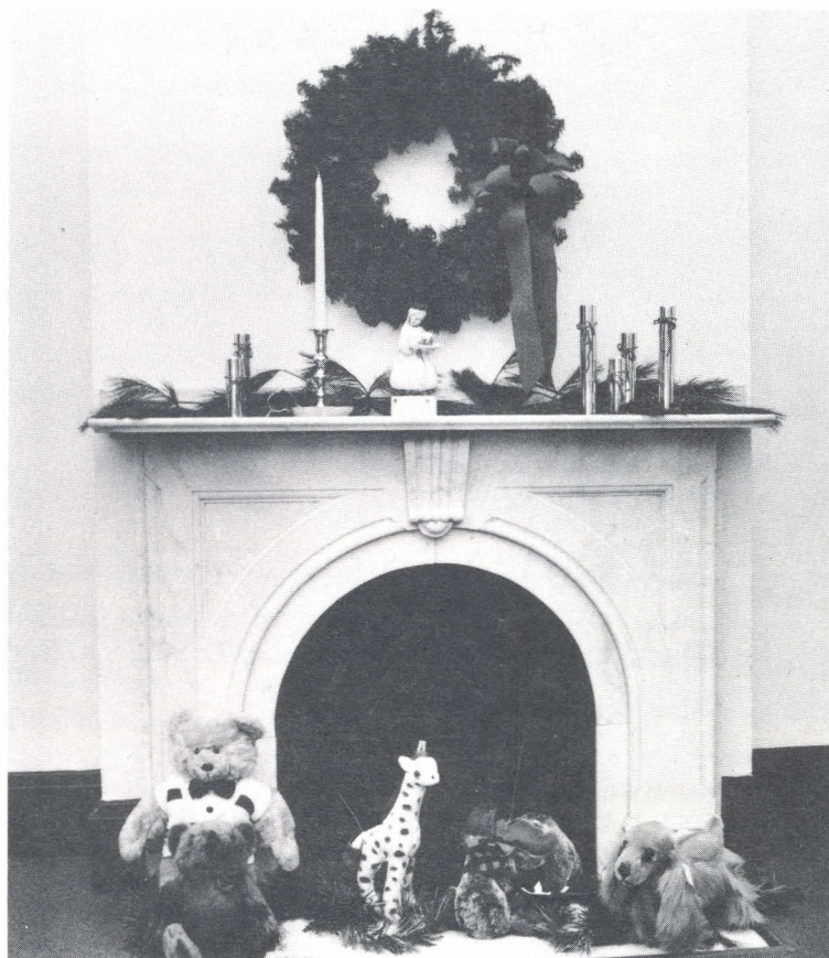
CANDLES, ANGELS, and stuffed animals await the annual Gift Shop Christmas Fair, scheduled for November 16-December 5, in the Admitting Lobby.