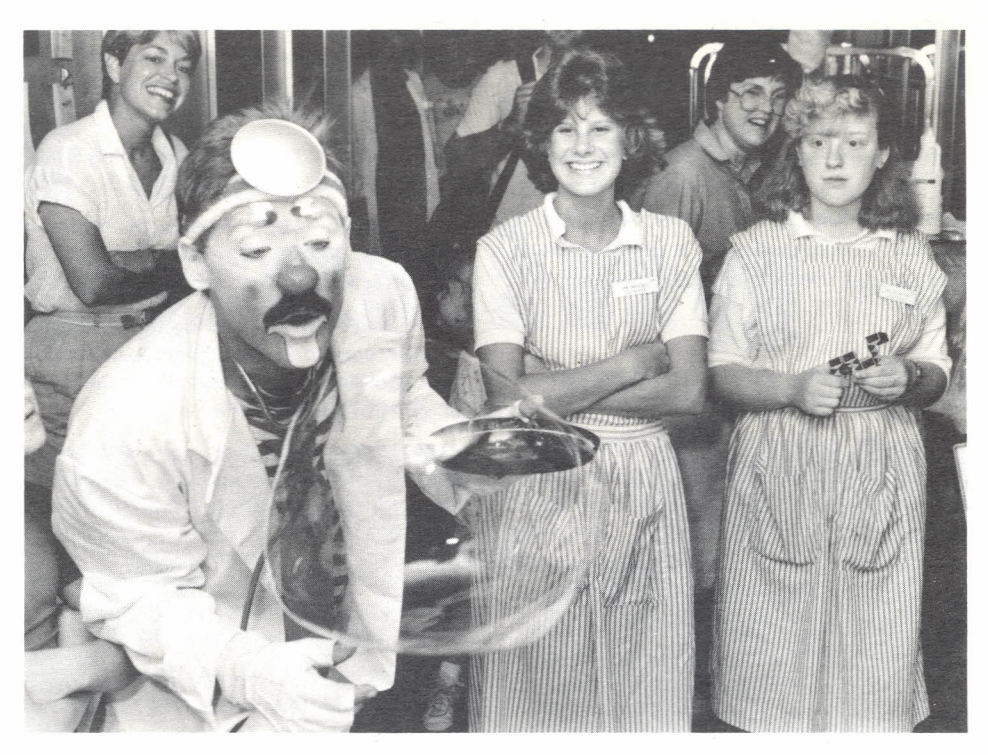
CLOWN VISITS are well-known for the joy they bring to patients on MMC's Pediatric Unit. Often overlooked, however, is the pleasure they bring to staff, families, and visitors. Above, a Big Apple Circus clown creates a giant bubble, to the amusement of all.

The Volunteer Office is always in need of magazines for the hospital. Any donations would be appreciated.