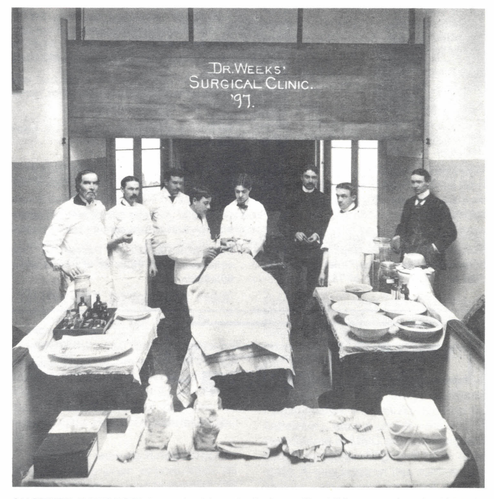
ANOTHER FAVORITE from the historical photo file. This was taken in 1897, in Maine General Hospital's surgical amphitheatre. We've come a long way ...

* Probably taken at Bowdoin College [medical School ] IL non