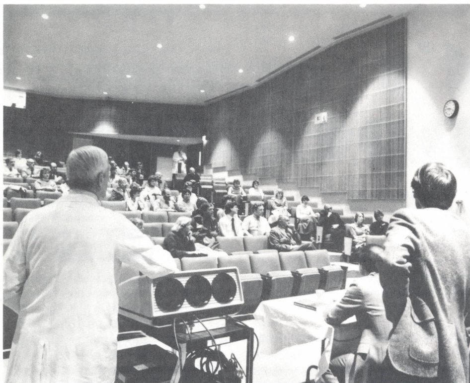
THE PENDRED NOYCE AUDITORIUM is the centerpiece of the Charles A. Dana Health Education Center, now two years old.