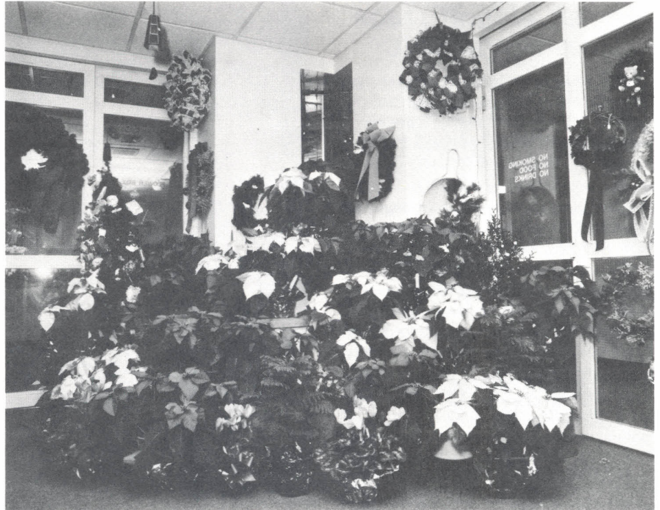
THE FLOWER BOX overfloweth with holiday flowers. This photo was taken just after a delivery, and there will be poinsettias and other seasonal plants available in the Flower Box through Christmas.

The public restrooms off the Bramhall Lobby, toward the Clinics, are closed for renovations that will make them more accessible for the disabled. They will be closed for two or three weeks.