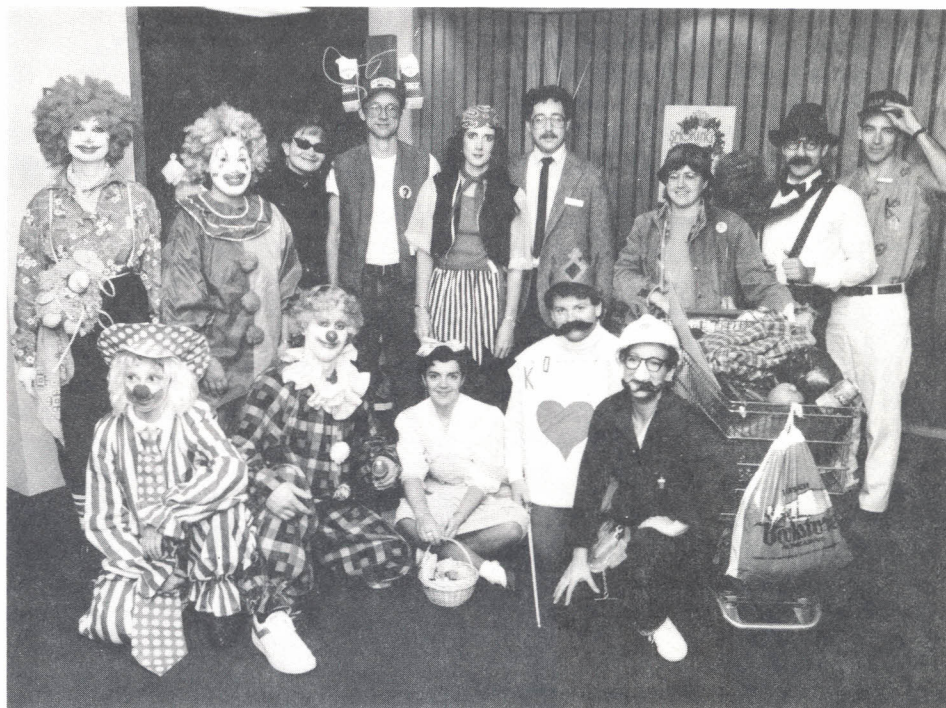
THE ANNUAL HALLOWEEN costume parade was in evidence at MMC October 31. The motley crew above was assembled from Radiology, Radiation Therapy, and Ultrasound. More Halloween photos inside...