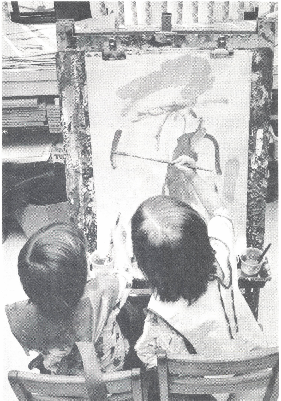
OBVIOUSLY A MASTERPIECE is in progress as two young patients spend some free time in the Pediatric Playroom. Many such one-of-a-kind works of art can often be seen decorating walls in and around the Playroom.

For more information or to enroll, contact the Employee Benefits Office, ext. 2973.