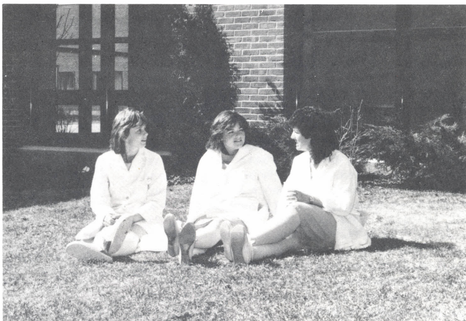
THE FIRST WARM DAYS OF SPRING last week brought winter-weary sun lovers out into the MMC courtyard for a dose of sunshine. For a closer look at the courtyard, see page 2.

The rate adjustment will keep the Medical Center's revenues within the patient care revenue limits permitted by the Maine Health Care Finance Commission. Increased demand for services, especially in ancillary areas (laboratory tests, radiology, operating rooms, etc.) had pushed revenues beyond budget projections for the first five months of the fiscal year.