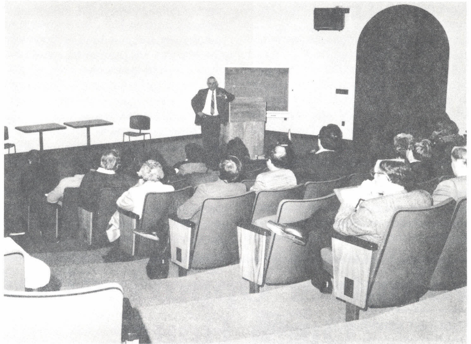
MAINE LAWMAKERS AND HOSPITAL ADMINISTRATORS shared opinions during the economic fact-finding tour sponsored by the Institute on the Maine Economy.