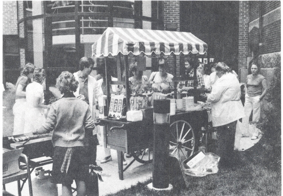
SIDEWALK FOOD VENDING came to MMC's courtyard last week, as Food Services opened its new grilled hamburger and hot dog stand --- to rave reviews from lunch-time crowds.

An exact starting date for the project will be announced soon in What's Up .