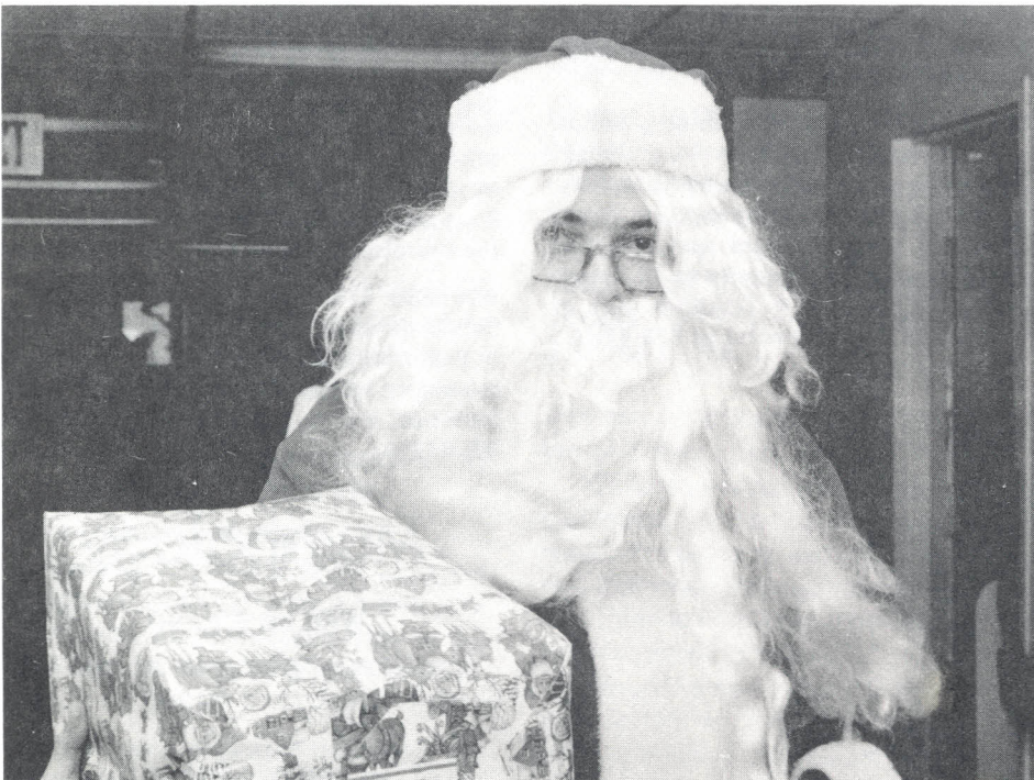
THE PORTEOUS SANTA arrives for the Pedi party at which he traditionally presents gifts he selected personally for each patient on the unit.