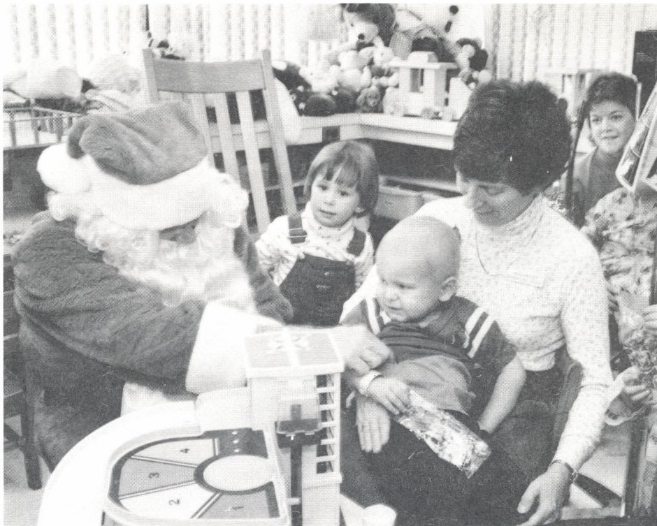
THE WYNZ SANTA dropped by to visit and take last-minute requests from youngsters on his Christmas list.