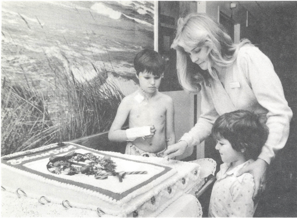
A CHRISTMAS ISSUE of Business Digest magazine was baked and decorated as a gift for MMC patients.