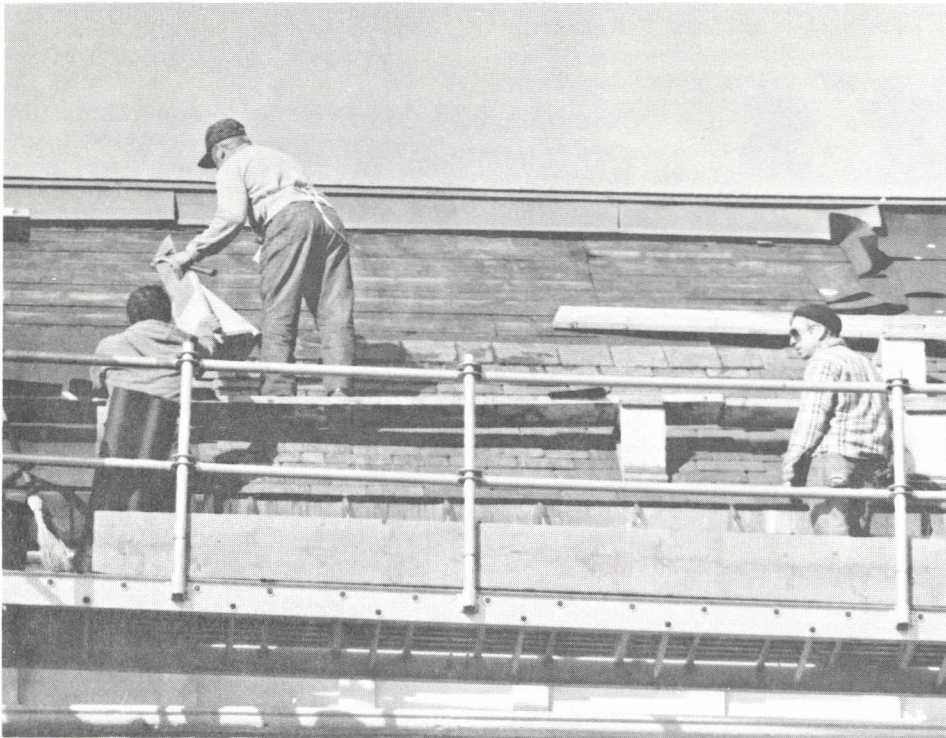
OFF WITH THE OLD, ON WITH THE NEW . . . roofing , that is, on the Maine General Building. The roof is getting its first complete resingling -- all in slate -- since it was built in 1870.