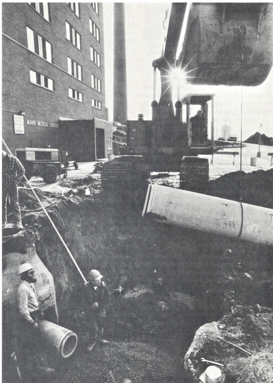
THE SUN HAS BEEN SHINING on Maine Medical Center's construction project so far. All work is reported to be on schedule, including the laying of storm drains near the Emergency entrance as shown above. This is part of the site preparation work that must precede excavation for the new building.