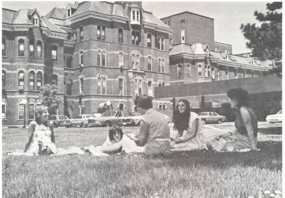
SUMMERTIME means lunch on the lawn for many MMC people, including these employees from Medical Records.