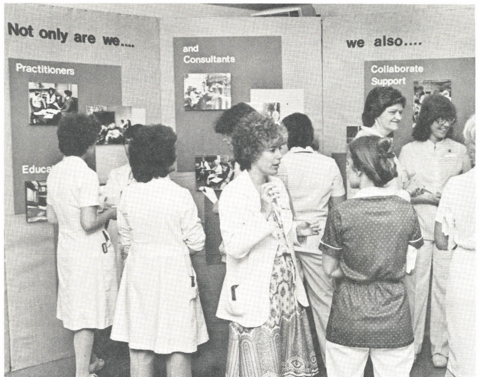
MMC'S NURSE SPECIALISTS met and talked with other employees at Clinical Nurse Specialist Day, May 29.

The nurse specialist assists Staff Development instructors, nursing supervisors, and nursing administration, in the development, organization, teaching, and evaluation of education programs in her special area. She is also ready to assist staff nurses and other members of the health care team in applying the best and most up-to-date nursing practices to patient care.