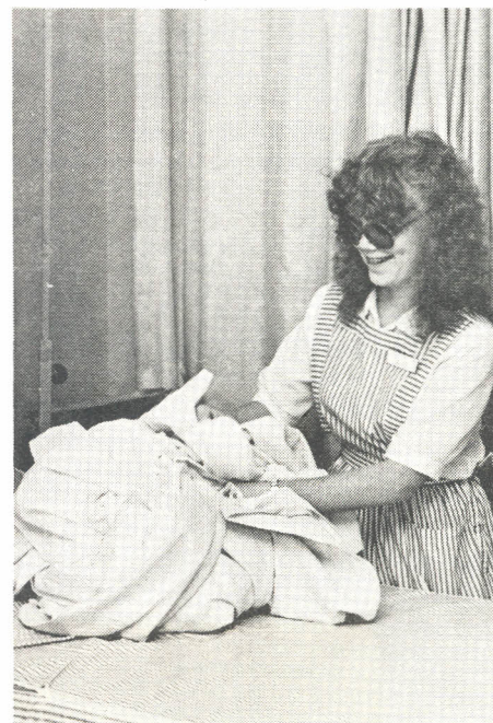
JUNIOR VOLUNTEER jobs throughout MMC are important in support of health care, rewarding to the volunteer, and appreciated by staff and patients alike.