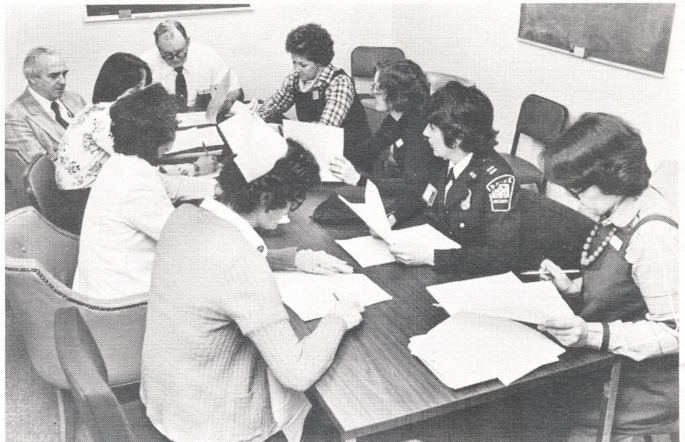
THE EMPLOYEE ACTIVITY COMMITTEE lays plans for future projects.