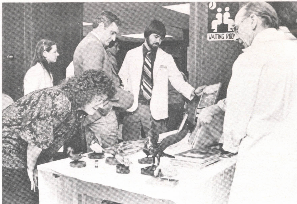
EMPLOYEES and visitors examine displays at the annual EAC crafts show, held Thursday, March 13.