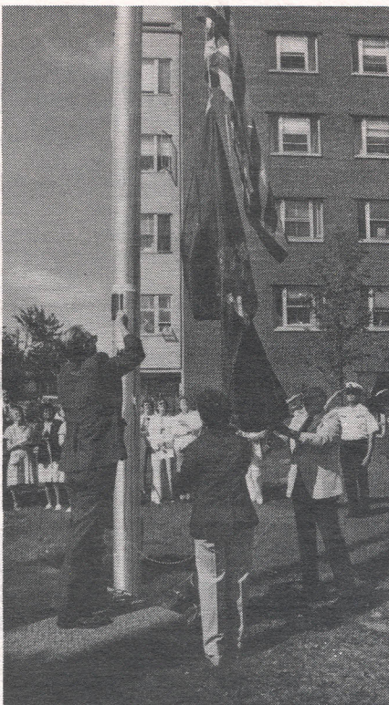
A flag flies at MMC at last...

FOR SALE: Gray kitchen set, formica top, 4 chairs. $35. 9X12 green rug, 5X10 rug w/mat, $100 or best offer. 9X12 rug w/7X4½ piece, beige & brown, $50. 773-0919.