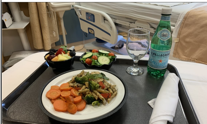
Left: A vegetarian meal option.