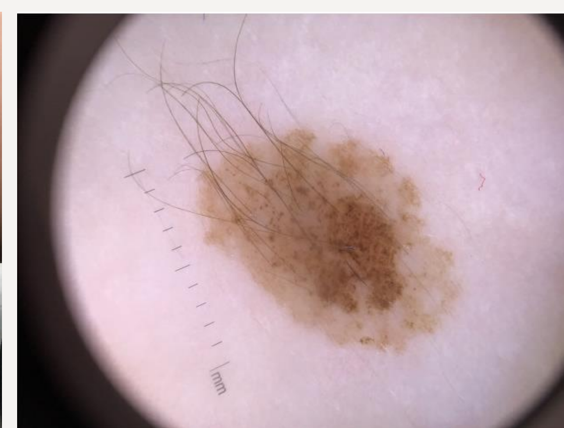
Case 1. eConsult of Congenital Melanocytic Nevus Dermoscopy reveals a mixed globular and reticular pattern with hypertrichosis.