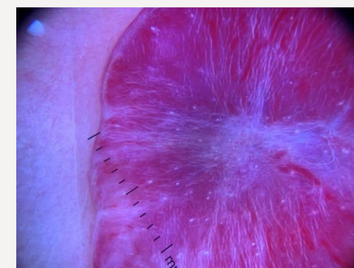
Case 2. eConsult of IH Dermoscopy reveals central white color associated with impending ulceration.